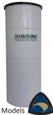
Models KB1 - KB2 - KB3

Our disposable bag range virtually eliminates contact with dirt and dust. The double layered micro filter lined bags last most families 4 - 6 months.