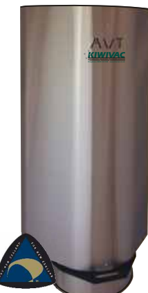
Models AVT2 - AVT3